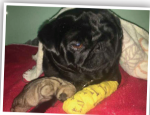
Geraldine and her one little puppy.

Honestly I LOVE my job - actually it's a privilege to be able to help animals in the way we can and do. As you can see, every day is extremely different, very challenging at times with difficult medical cases or surgeries but the buck stops with me so to speak. I leave after my 12 hour shift very tired and hungry! But with a big smile on my face knowing that I've made a difference in many animals lives that day and so have my fabulous team.