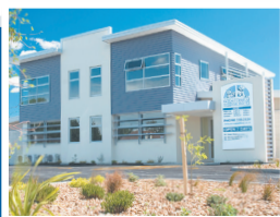
McMaster & Heap

E. mcmasterandheap@yahoo.co.nz www.mcmasterheap.co.nz