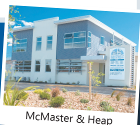
McMaster & Heap

E. mcmasterandheap@yahoo.co.nz www.mcmasterheap.co.nz