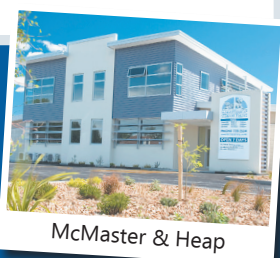
McMaster & Heap

E. mcmasterandheap@yahoo.co.nz www.mcmasterheap.co.nz