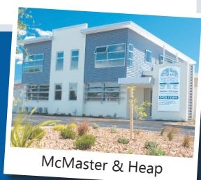
McMaster & Heap

E. mcmasterandheap@yahoo.co.nz www.mcmasterheap.co.nz